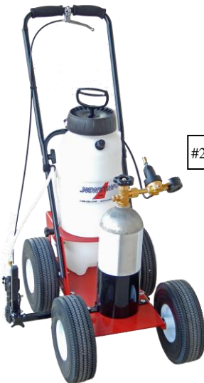
CO 2 Power Pack mounted on FieldLiner 3™ Paint Sprayer